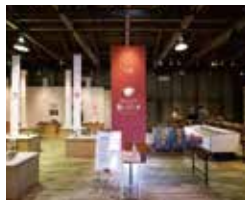
Food Design Exhibition (tentative name)

Get ready for an event-packed week! Public events will take place alongside industry and company events in Asahikawa and its surrounds.