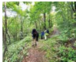
Forest walking tours